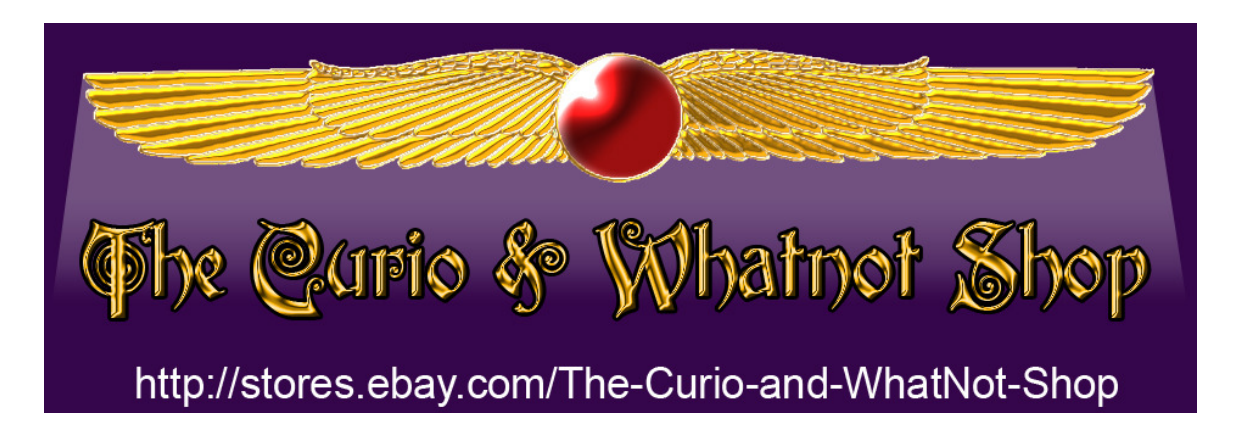
This e-Book came to you from